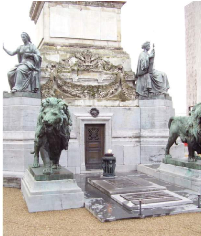
Monument for the Unknown Soldier of Belgium