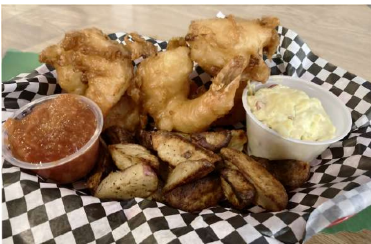
Everyone enjoyed Gina's Shrimp Tempura on our April dinner night. June Special TBA.

LUNCH SPECIALS ARE SUBJECT TO CHANGE - REGULAR MENU AVAILABLE EVERY DAY