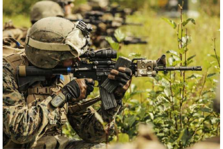
US Marine firing Colt M4 carbine