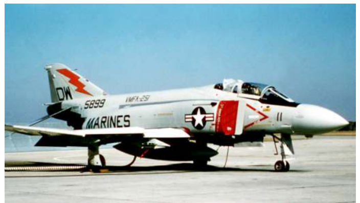
Marine Corps F-4 Phantom

Although Colonel Sanders served in the U.S. Army for several months before being honorably discharged, he was not an officer. The honorary title of "Kentucky Colonel" was later bestowed upon him in 1950 by his friend Lawrence Wetherby, Governor of Kentucky.