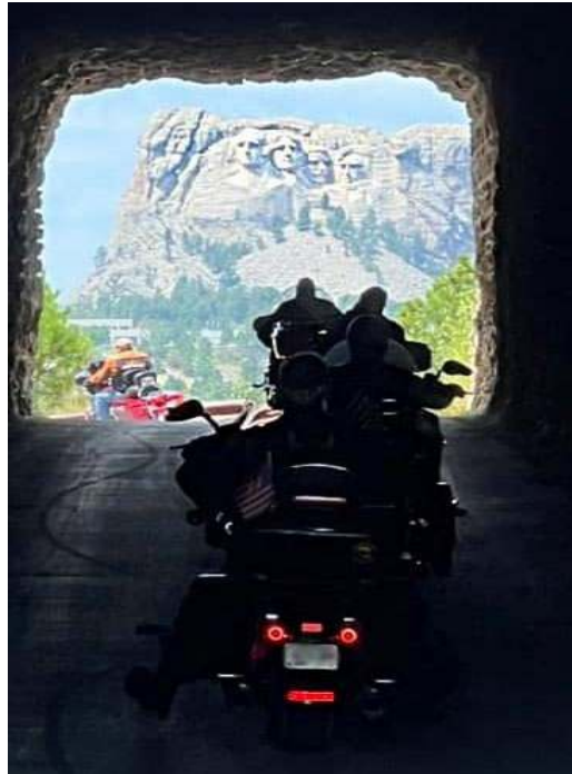
RIDERS AT STURGIS