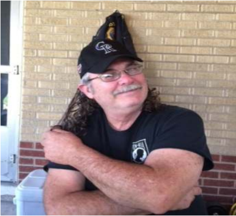
OUR PRESIDENT NEEDS A HAIRCUT